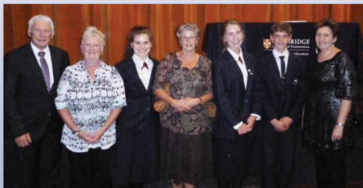
Outstanding Cambridge Learners awards ceremony

It is important to acknowledge that it is not just the achievements of the academically gifted that we champion. We are equally excited and professionally rewarded to see those students from across the academic continuum who have worked diligently and gained wonderful success by achieving to their potential and beyond. Teachers at Wentworth work hard and strive to understand each and every student, and to guide and encourage each student to develop a sound work ethic and output that ensures them the greatest opportunity for success.