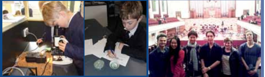
Students attending the NZSO concert on Friday, 20 June, 2014 in the Auckland Town Hall

A fashion icon, the Tee-shirt with an applied design, was the brief for the Year 9 Fabrics students in Term 2. Students rose well to this challenge and completed some colourful, abstract and topical designs on their shirts. Their inspirations were fuelled by fashion, hobbies, movies, sports, and creative ability. The students felt very proud of their results.